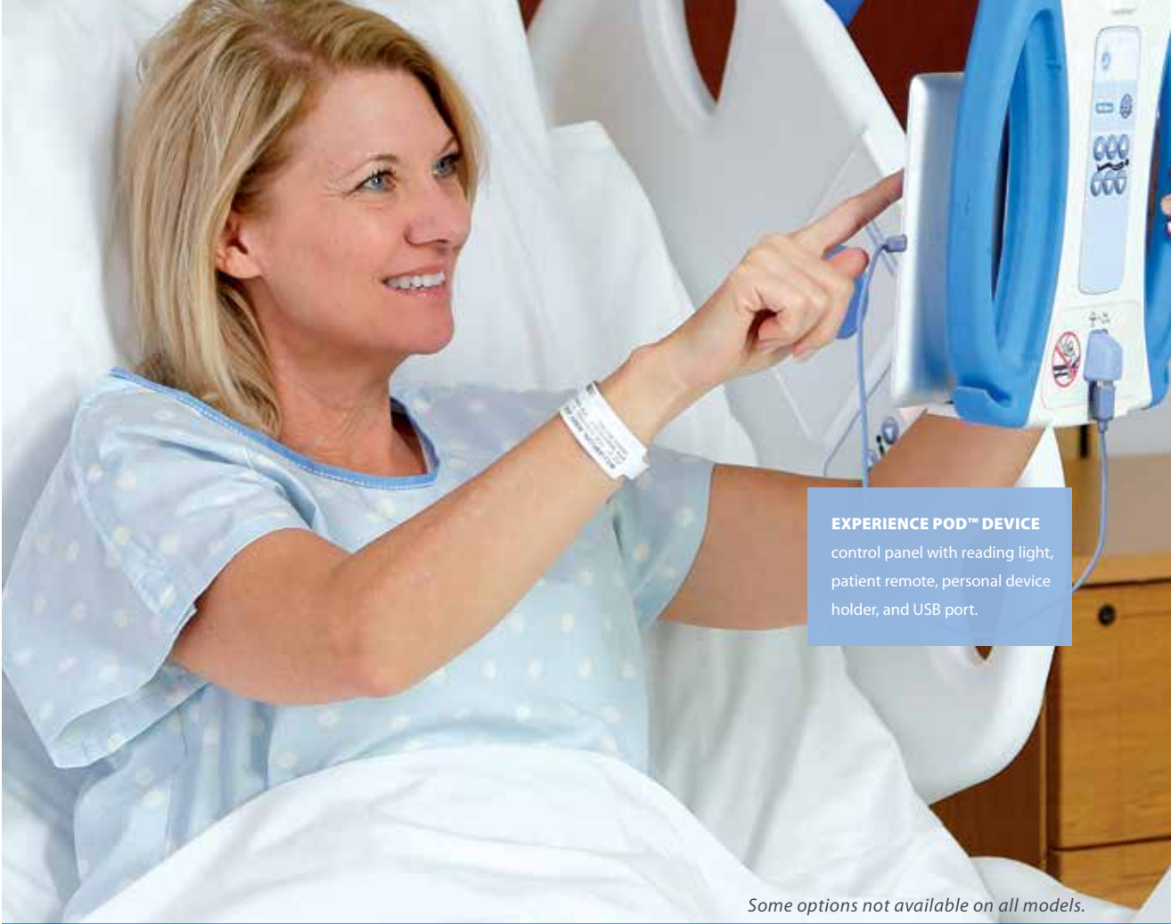
Some options not available on all models.

Learn about your bed at yourbed.hill-rom.com YOURBED.HILL-ROM.COM informs patients about use and benefit of the bed to help optimize their experience.